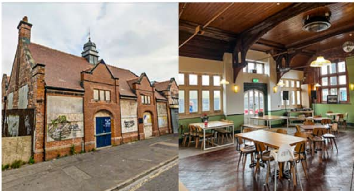
(The exterior when abandoned and the inside now)

For those of you who live near or in the Stockport area, you might be interested in a brilliant new café/bar opened on the A6 in Levenshulme. It is using the formerly derelict buildings of Levenshulme South Station, now beautifully restored. It's on Edward Watkin's 'Fallowfield Loop' and you can Google it under 'Station South'. It's really attractive for a meal or a drink and incorporates a cycle shop as well. The dream of the three people who thought up the idea was terrific and an act of faith. (One of their discoveries when they opened up the derelict building was a dead cow.) What is of special interest to the Watkin Society is their interest in the history of the station and its creator, Edward Watkin. We have already provided some Watkin material for an exhibition and may be able to hold a society meeting there in the new-year.