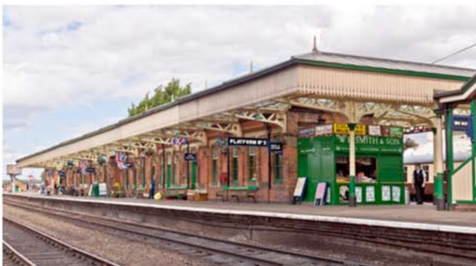
(Loughborough Central on the Great Central Railway:)

We are exploring the possibility of the Watkin Society working with the GCR to publicise Watkin's unique part in the formation of the railway. One possible rich vein to dig away at is to work with local schoolchildren. One of the leading GCR members says local people think that the only great railway people in the nineteenth century were the Stephensons. He wants to replace them with Edward Watkin (We'd be glad to help!) The GCR has plans to open an Audio-Visual suite in the new-year at one of its stations. It will feature Watkin's life and his work for the railway.