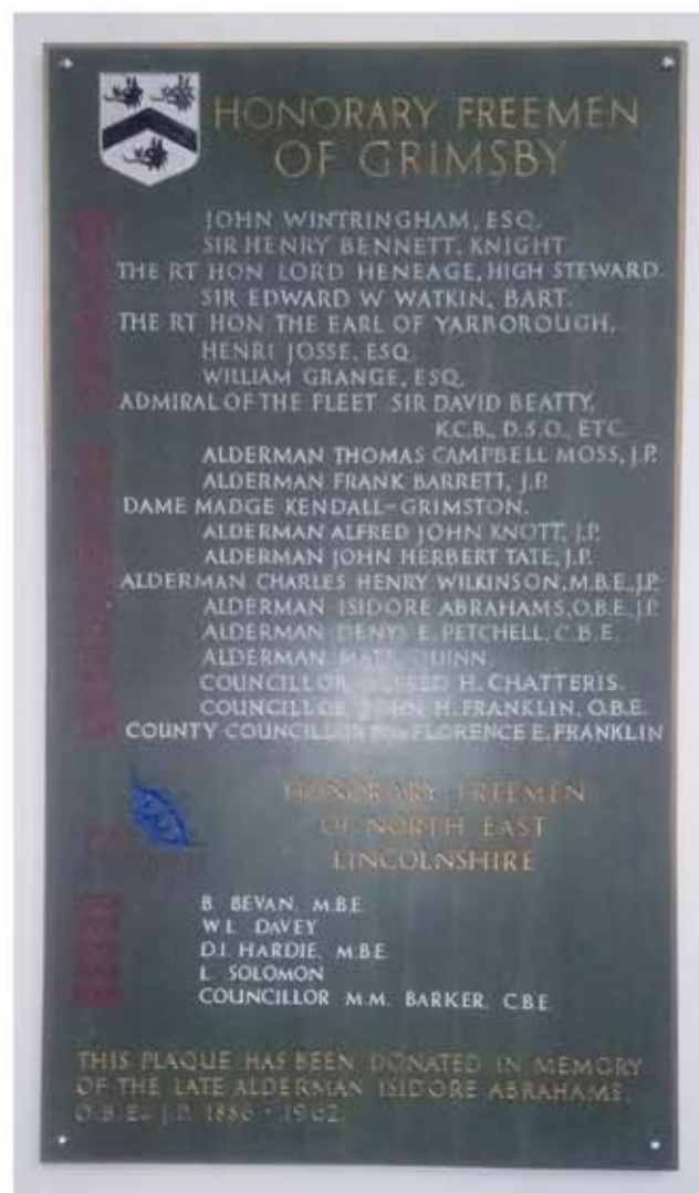
(Above; Watkin's statue for Prince Albert and the Freeman of Grimsby Plaque at the Town Hall)

A number of local residents experienced in community work are interested, including a Facilitator, who will pass to a wider audience the activities of the group, including a number of exciting research projects that have already been identified. Two Zoom meetings have been held and a Core group has met to plan future activities. A further meeting will be held on 5 December. One local history group has asked to set up a Watkin link.